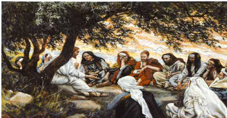
Christ's exhortation to the twelve Apostles by James Tissot