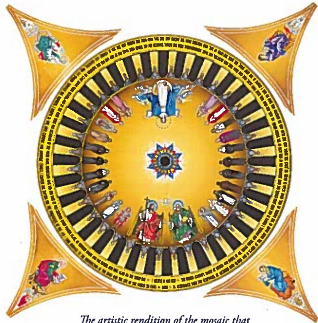
The artistic rendition of the mosaic that will adorn the Trinity Dome.

The Trinity Dome is the central and largest dome of the Basilica. This "Crowning Jewel" will be adorned in mosaic and will depict the Most Holy Trinity, the Blessed Virgin Mary as the Immaculate Conception, and a procession of saints who have an association with America and the Basilica. The Nicene Creed will encircle the base of the dome, while the dome's pendentives will feature the four evangelists: Matthew, Mark, Luke and John. The Trinity Dome will complete the work of the Great Upper Church according to its original iconographic scheme and bring to a close construction of the Basilica of the National Shrine of the Immaculate Conception as it approaches its centennial milestone in 2020.