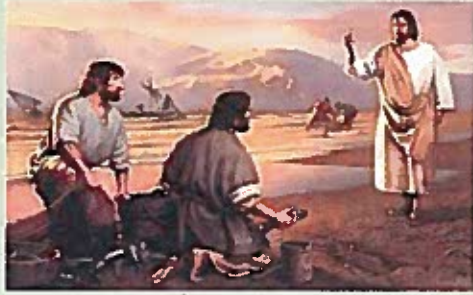
The First Disciples of Jesus